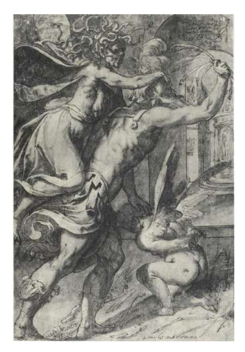
Camillo Mainardi, Mars Whipping Cupid, Pursued by a Fury